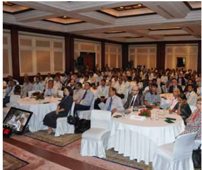
Participants at the Summit