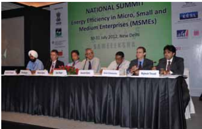
Panelists at the Finance session

Trade (PAT) scheme may be extended to MSMEs as ‘Designated Clusters’ for mass impact.