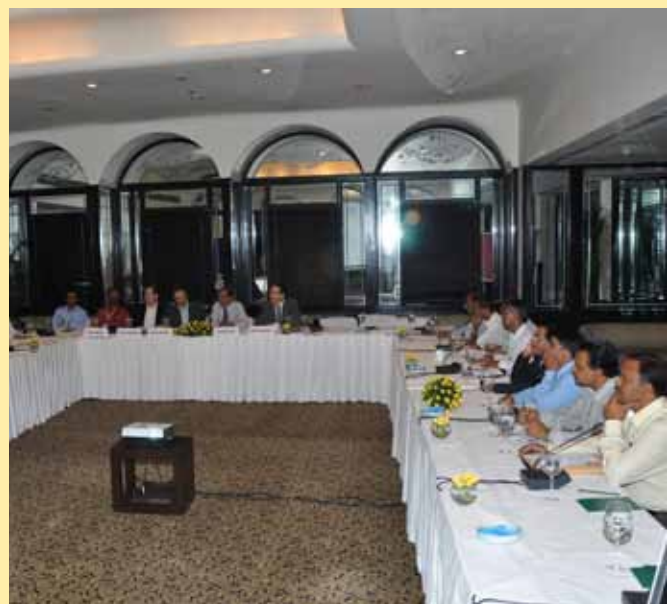
Promoting Indo-French cooperation among MSMEs

A visit to the identified clusters by experts and representatives from technical centres of excellence in France, e.g. CETIAT (French Technology Centre), would help in (i) deepening the understanding of the technologies and practices at cluster level, (ii) identifying areas for performance improvements and (iii) developing strategies for interventions.