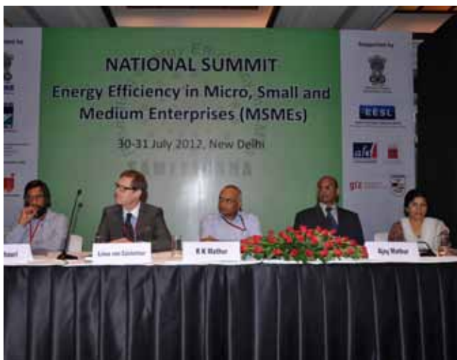
Dignitaries at the inaugural session

The deliberations at the Summit focused on finding an answer to one key question: How can we enable MSMEs to become more energy efficient? In their efforts to find an answer and to define directions for further course of action in the MSME sector, the participants shared their knowledge, experiences and ideas in a series of intense and interactive sessions that spanned the three broad realms of policy, technology and finance.