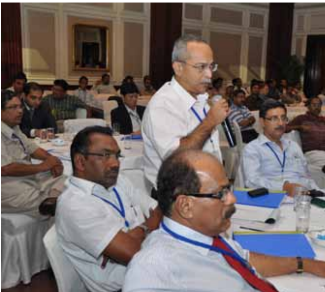
Setting the theme - interactions among participants