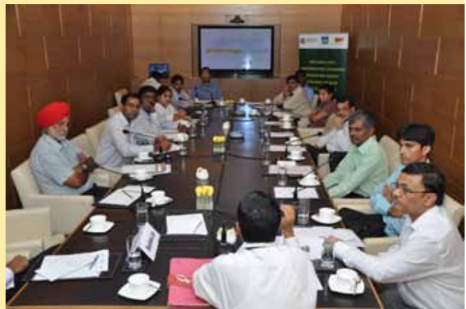
Project dissemination workshop